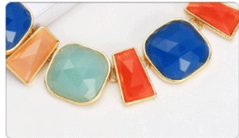
► Semi-Transparent Resin