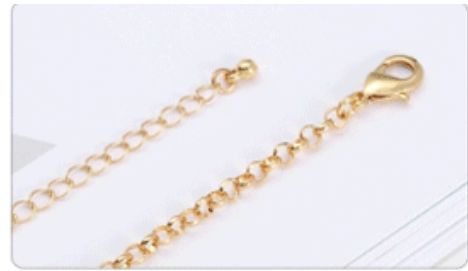
► Lobster Claw