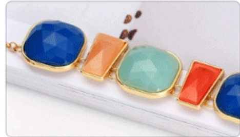
► Semi-Transparent Resin