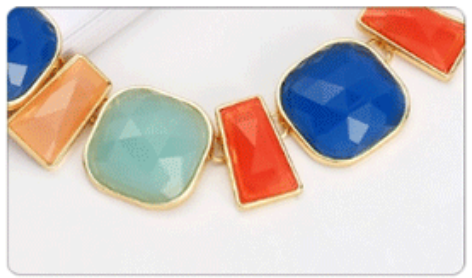
▶ Semi-Transparent Resin