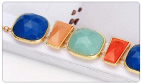
▶ Semi-Transparent Resin