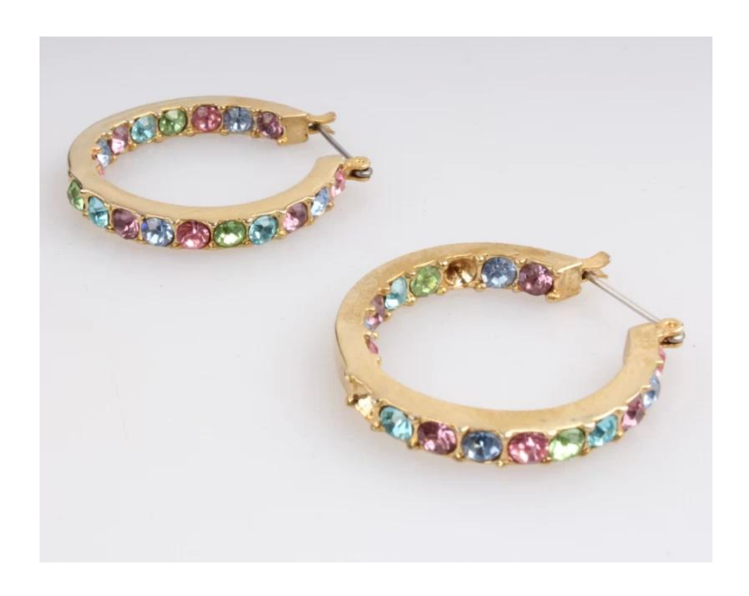
#OEM/ODM are welcome .