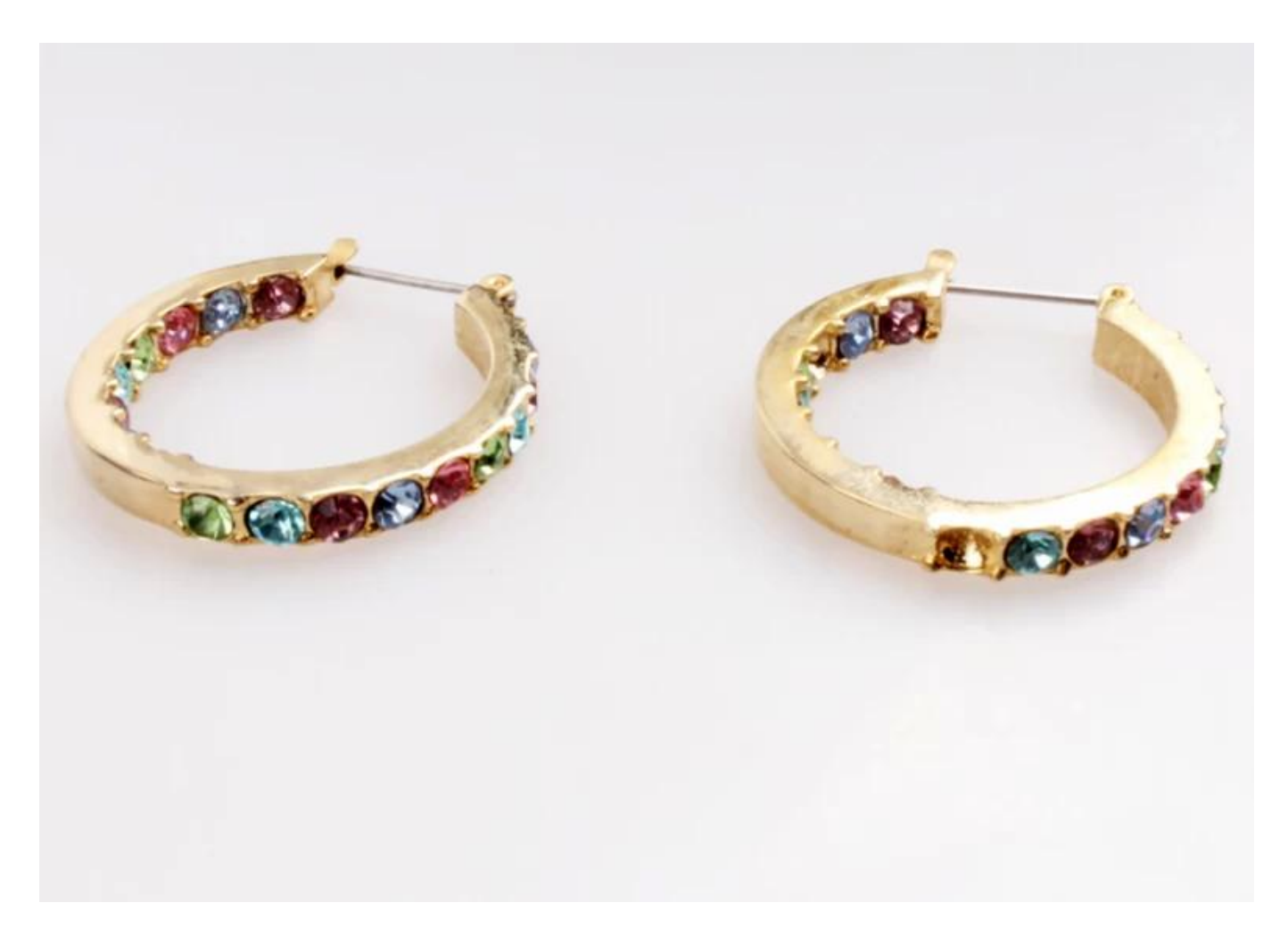
# Jewelry Wholesale Earrings.