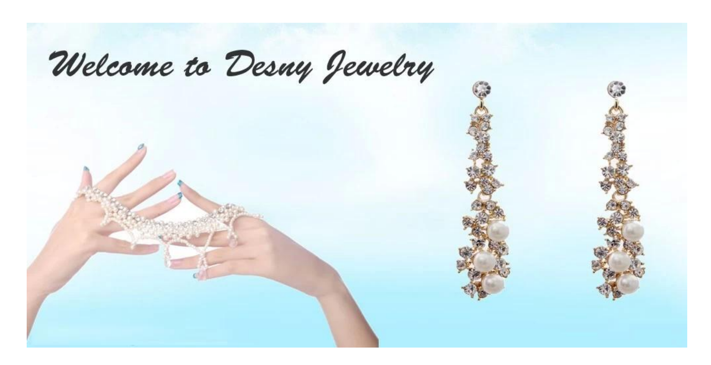
2018 Jewelry Europen Style Charm <u>Bracelets for Women</u> Multi Design B racelets