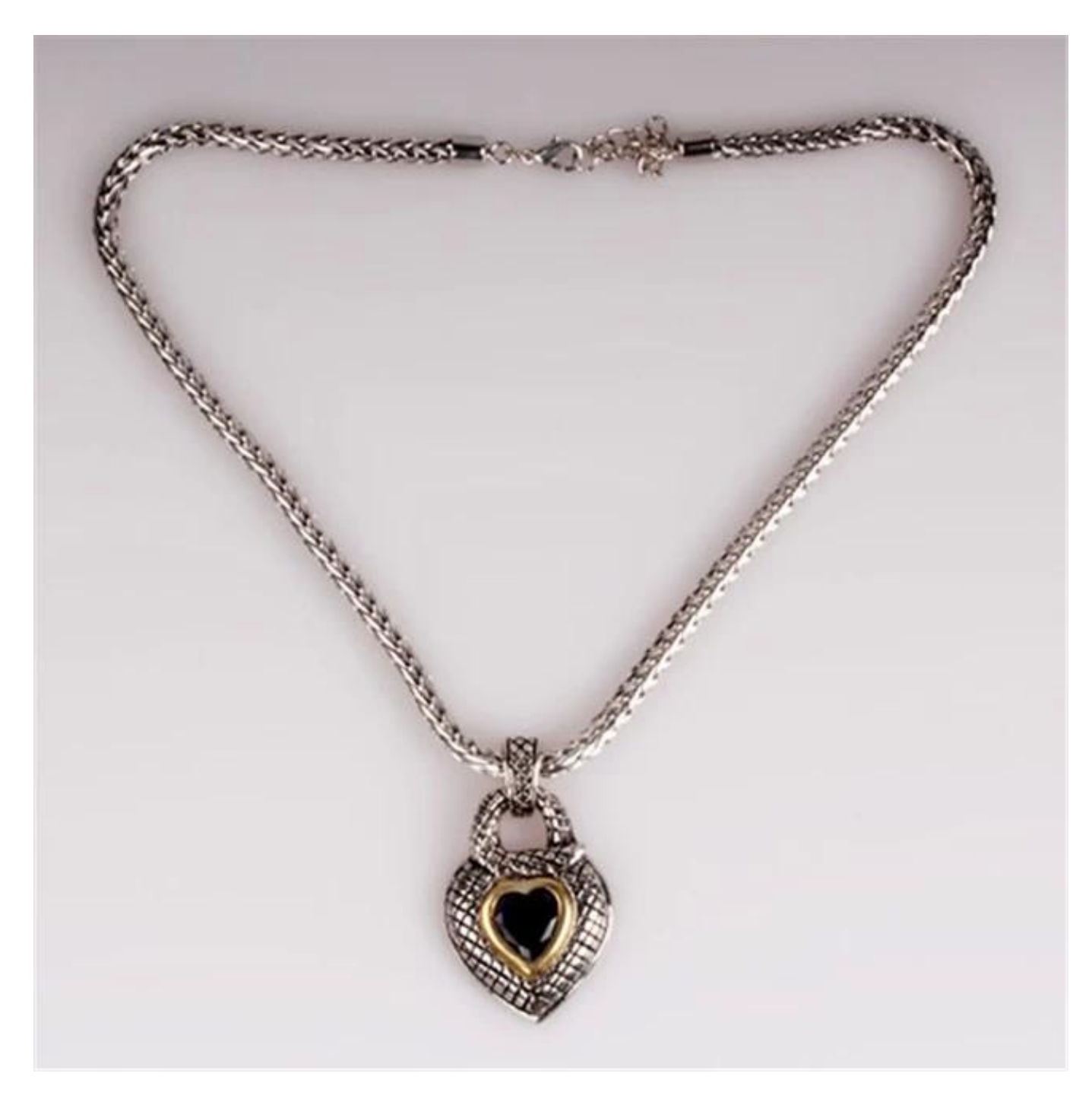
# Necklaces costume jewelry