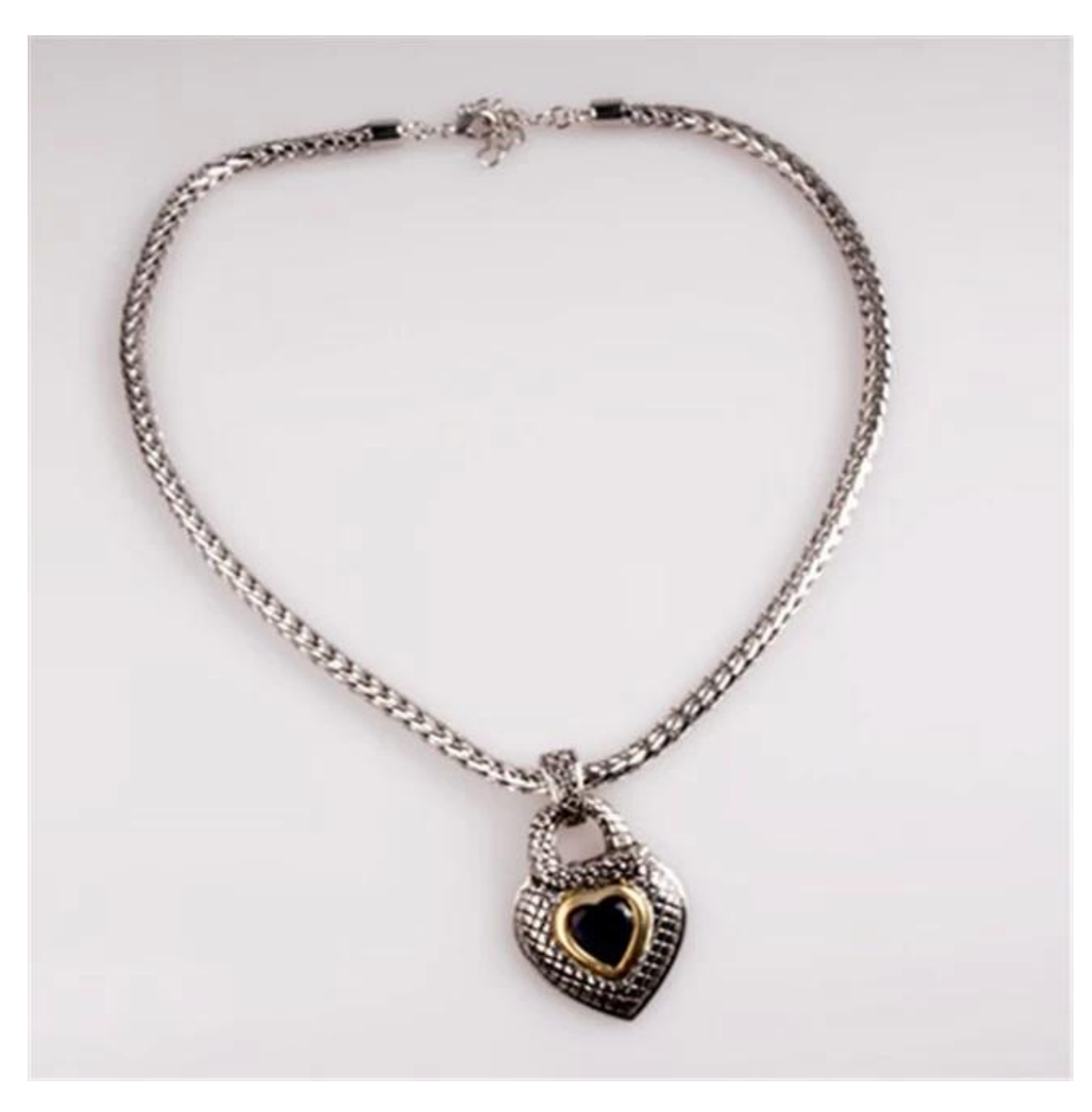
#OEM/ODM <u>Jewelry</u> are welcome.