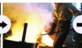
Infusing Brass Solution