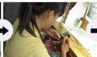
Inlaying Synthetic CZ