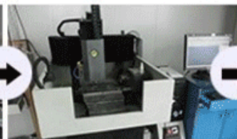
Making Wax Mould