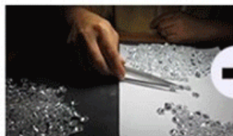
Selecting Synthetic CZ