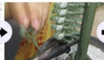
Inserting Wax Tree