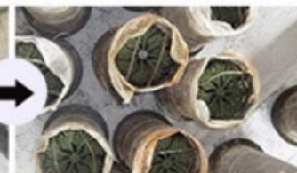
Infusing Gypsum Slurry