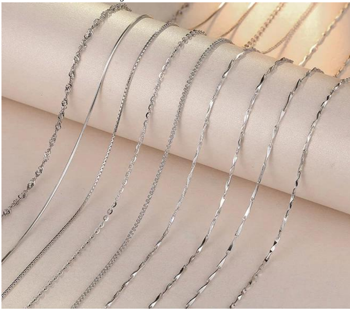
High Quality 925 Chain Necklace Wholesale in China

China Manufacturer Sterling Silver Chain Necklace without Pendant