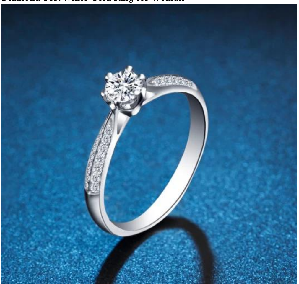
High Quality 18k white gold ring Manufacturer in China