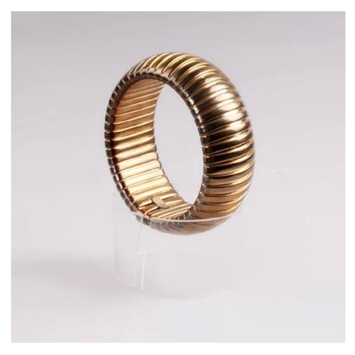
# Costume jewelry fashion Bracelet for Party , wedding.