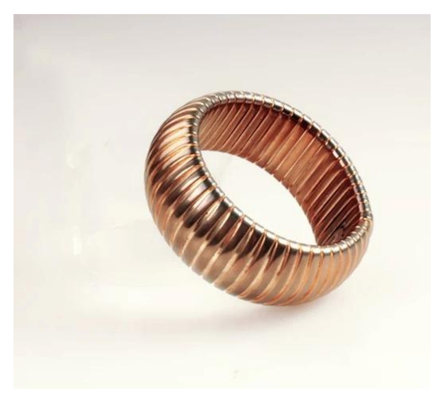
# Lower MOQ and support <u>free samples</u>.