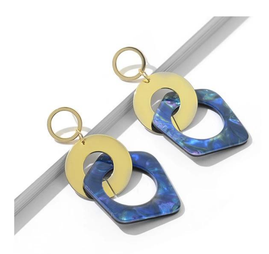
OEM Material and Color Stud Earring for woman