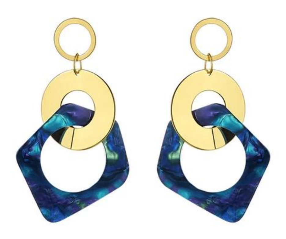
High Quality Dubai Gold Zinc Alloy Earring Manufacturer in China