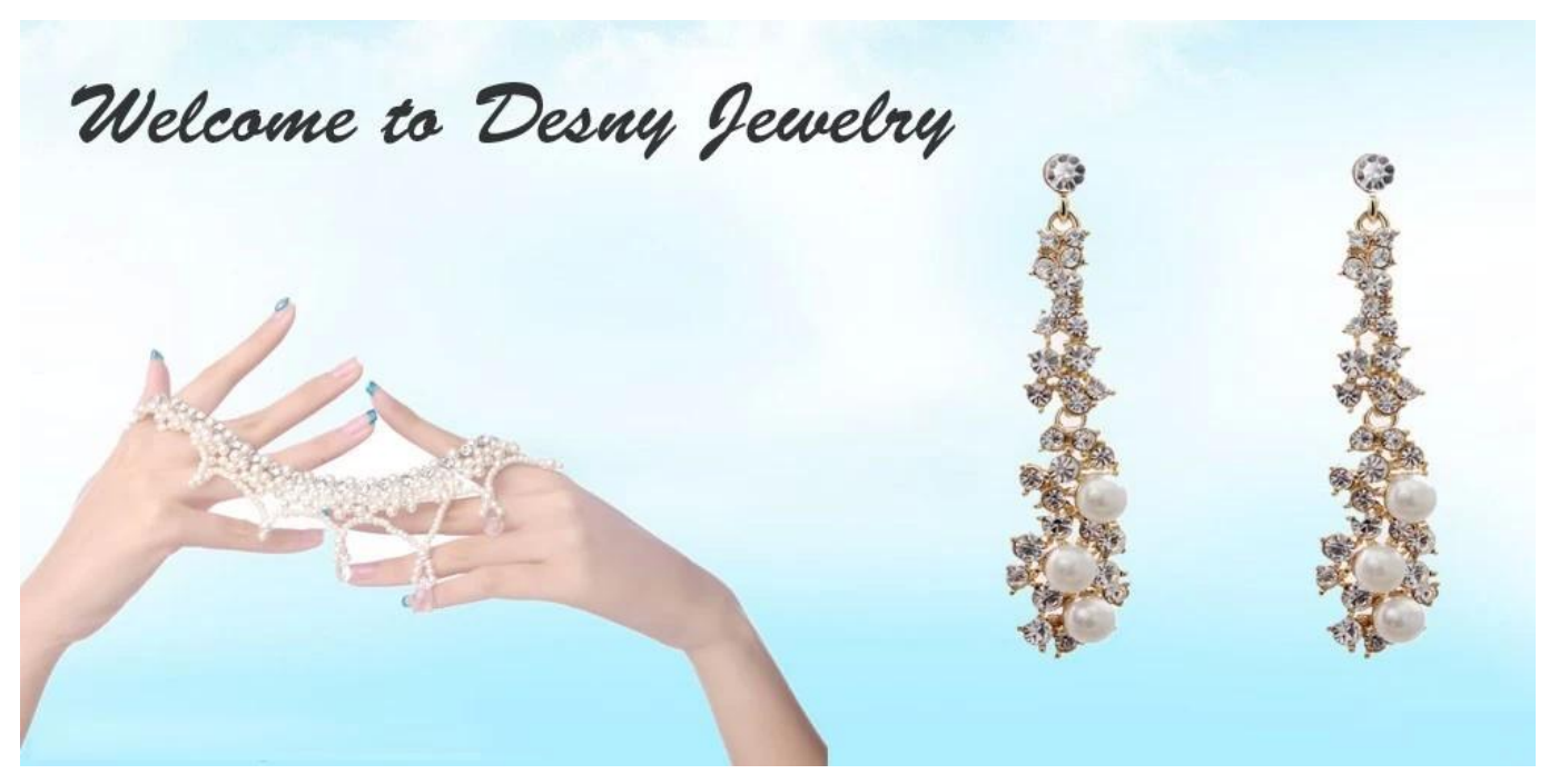
Flexible <u>Bracelet jewelry</u> 925 sterling silver jewelry cheap latest wedding ring wholesale China