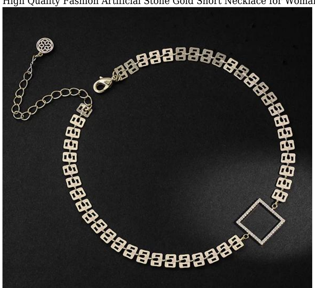
High Quality Fashion Artificial Stone Gold Short Necklace for Woman