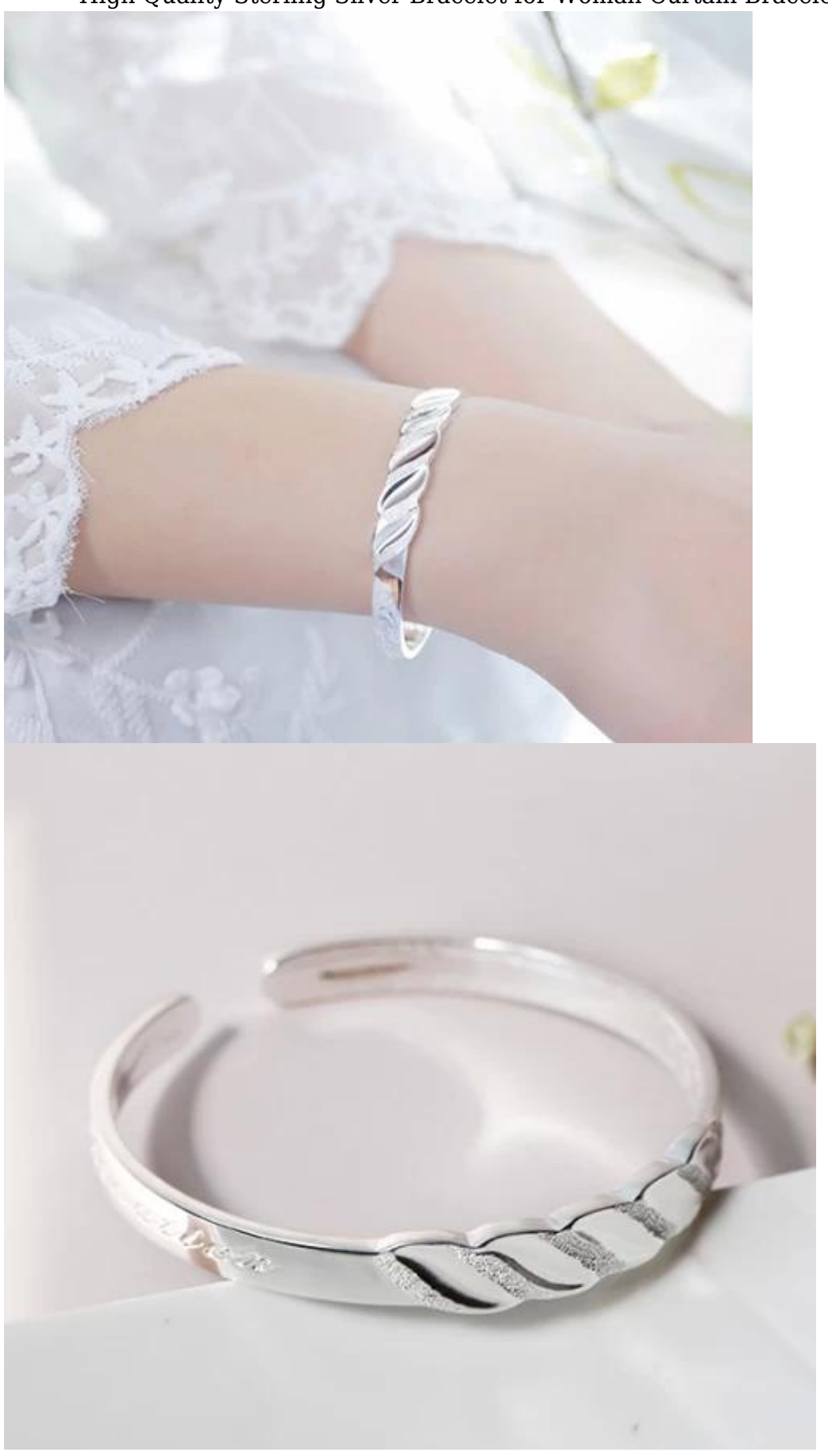
High Quality Sterling Silver Bracelet for Woman Curtain Bracelet Manufacturer