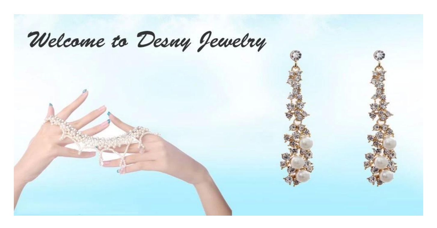
High Selling Quality Fashion Korean Model Selling Earrings Birthday Anniversary <u>Gifts for Women Mom Wife</u>