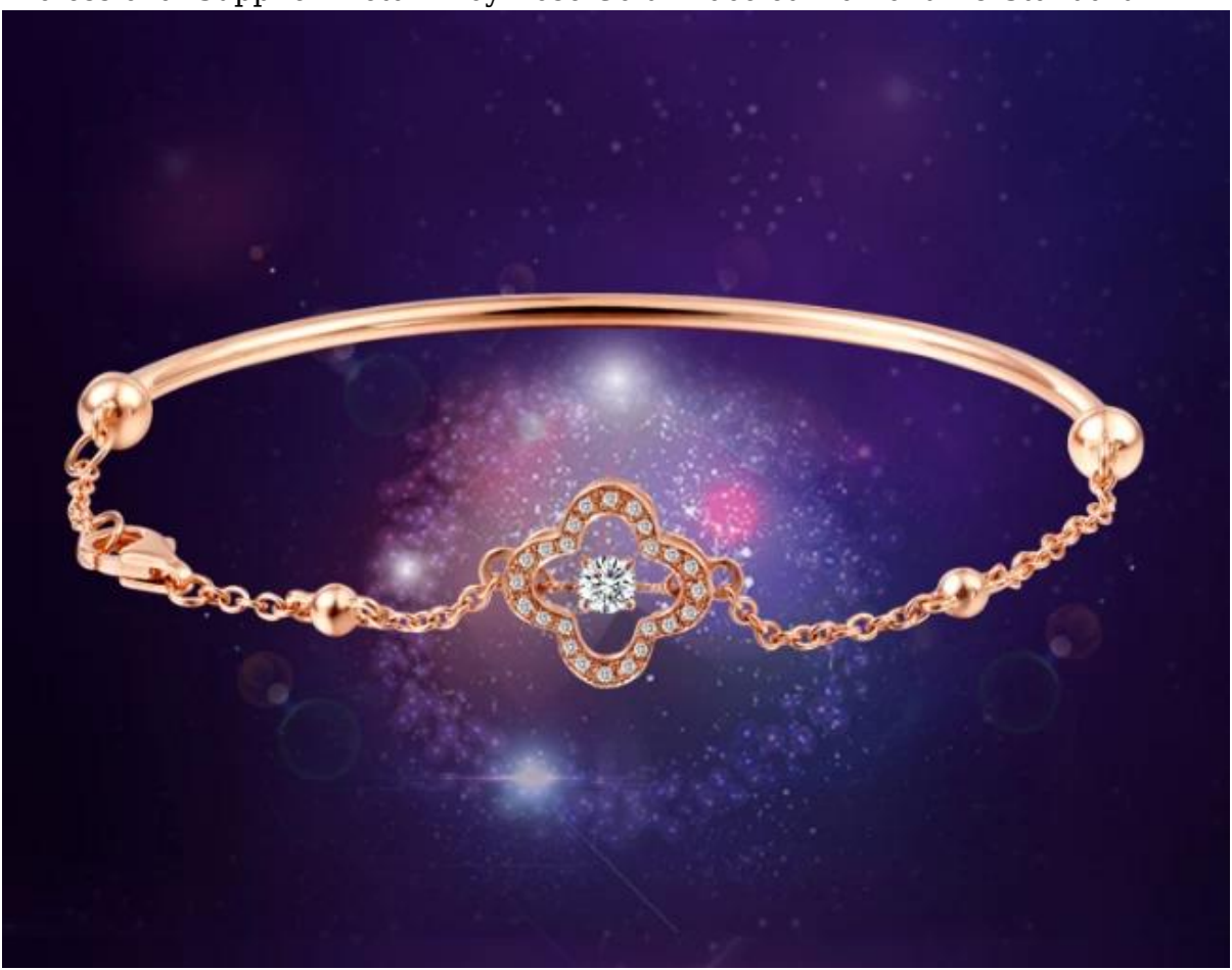
High Quality Diamond 4C Standard Bracelet Manufacturer in China

Professional Supplier Metal Alloy Rose Gold Bracelet Diamond 4C Standard