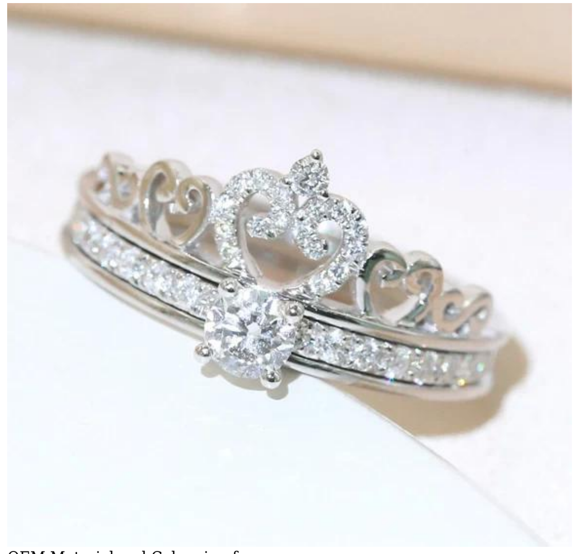
OEM Material and Color ring for woman