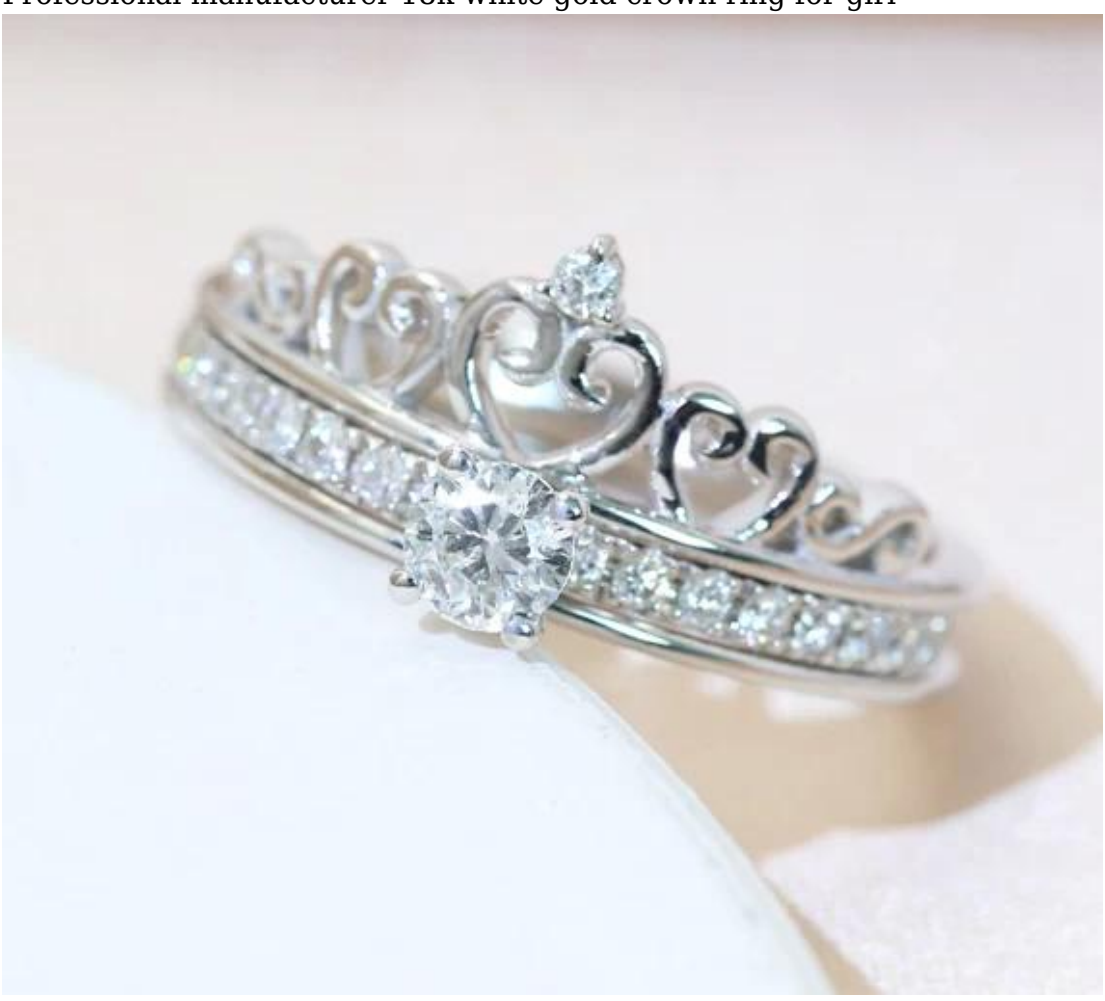
High Quality 18k white gold ring Manufacturer in China

Professional manufacturer 18k white gold crown ring for girl