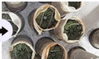
Infusing Gypsum Slurry