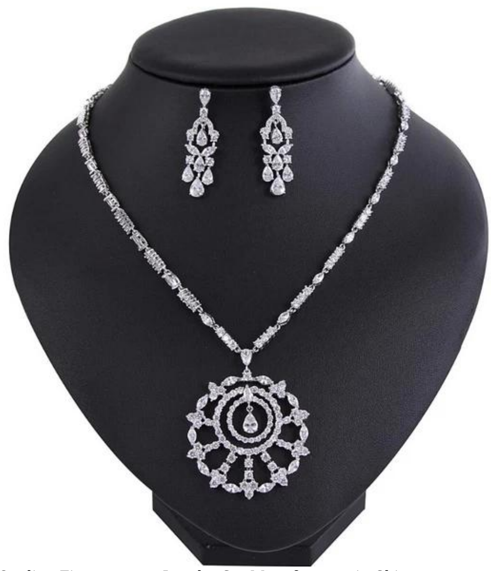
High Quality Zircon stones Jewelry Set Manufacturer in China

The latest designs crystal pendant crystal cubic zircon jewelry sets for women