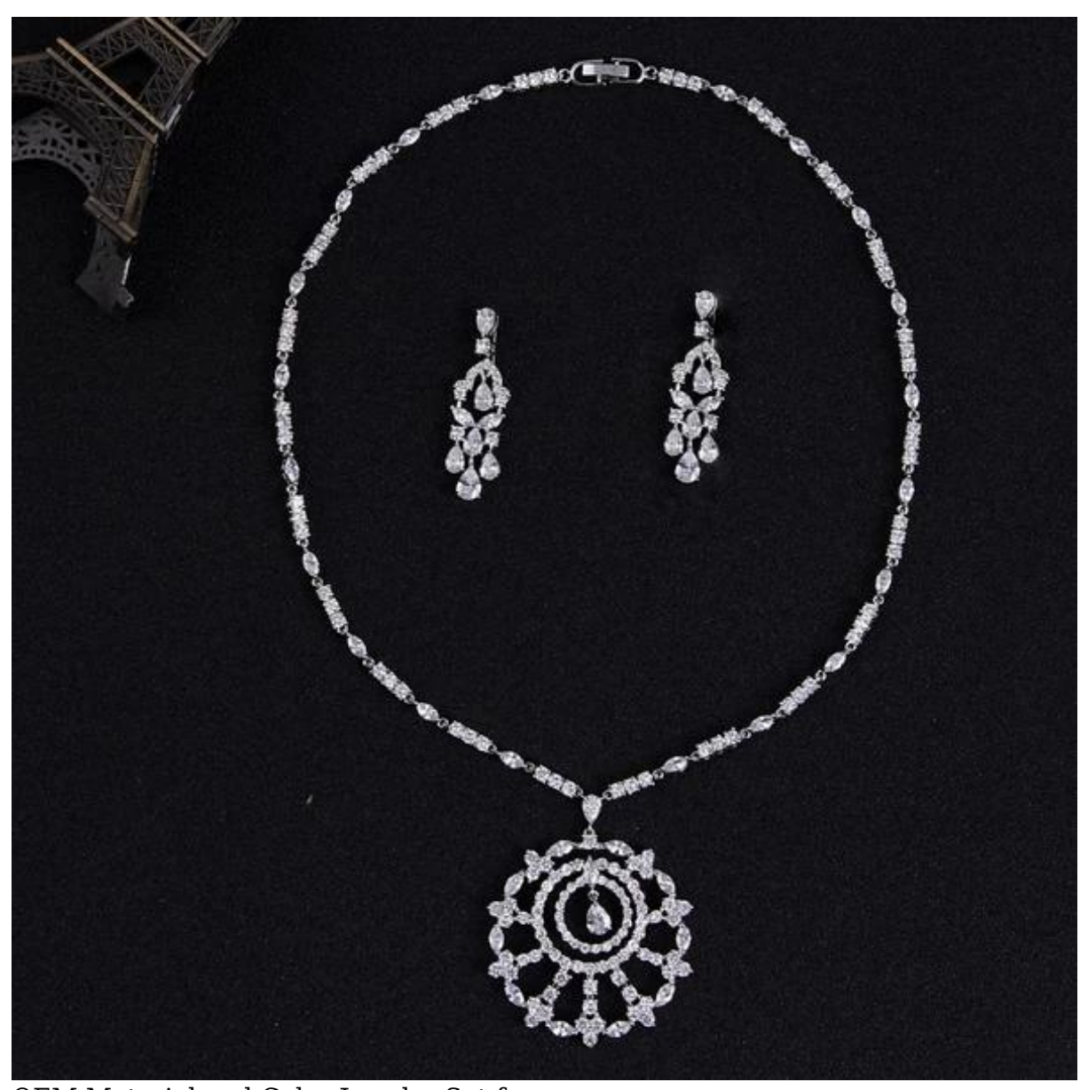
OEM Material and Color Jewelry Set for woman