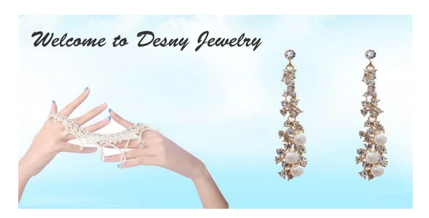
Wedding Rings For Women Engagement Ring Set 925 Sterling Silver Rings Earrings