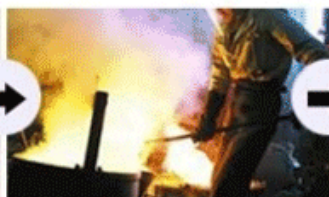
Infusing Brass Solution