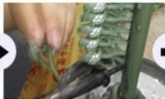
Inserting Wax Tree