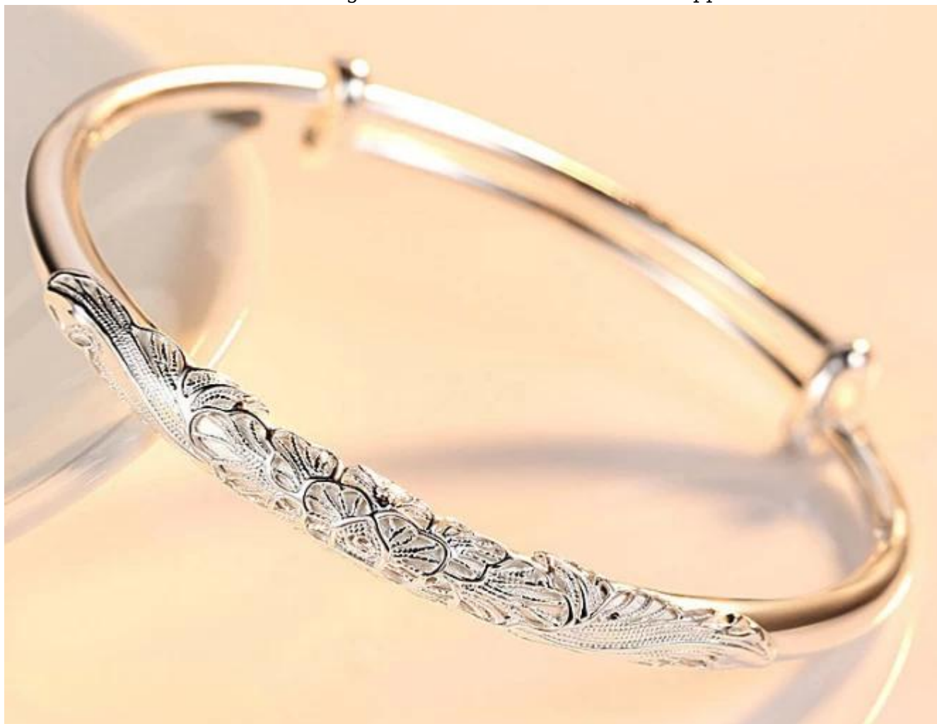
White 9999 Sterling Silver Rose Pattern Bracelet Supplier China