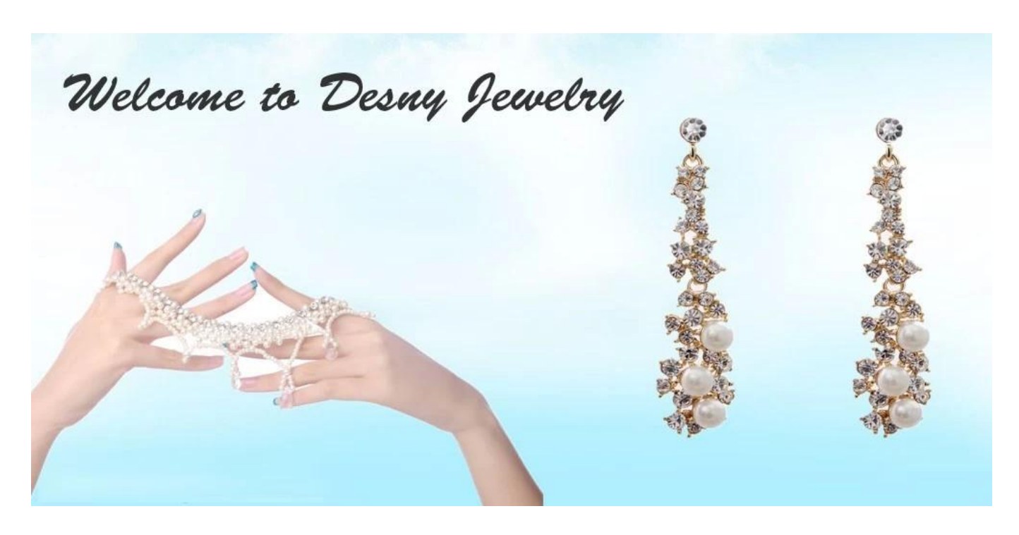
Woman 18K Rose Gold Brass Earrings Manufacturer China