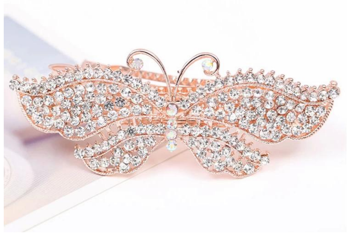
OEM Material and Color Crystal Rhinestone Hairpin for woman